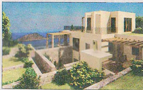
£868,600: in Crete, six off-plan Emerald Villas with gardens and pool and access to facilities at Elounda Peninsula Hotel

The family's Diamond Residences are 15 three to six-bedroom newly built leasehold villas beside the Elounda