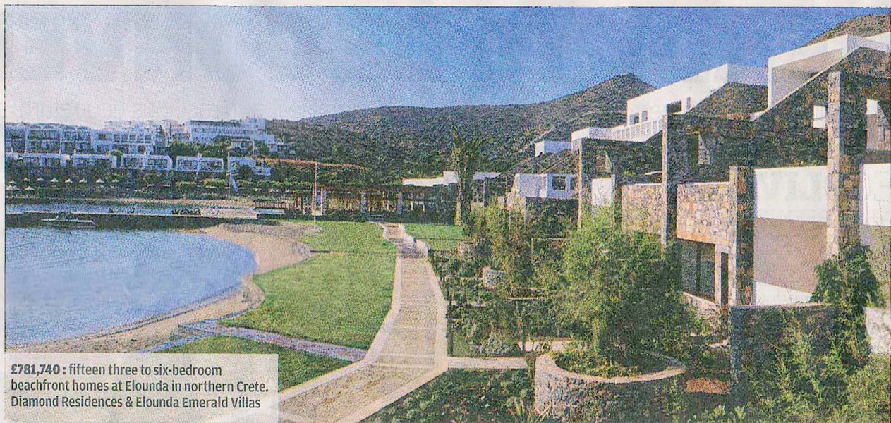
£781,740: fifteen three to six-bedroom beachfront homes at Elounda in northern Crete. Diamond Residences & Elounda Emerald Villas